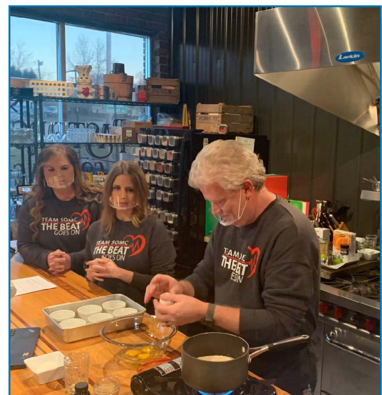
Photo from 2021 Cooking with Heart

All proceeds benefit the SOMC Heart & Vascular Fund.